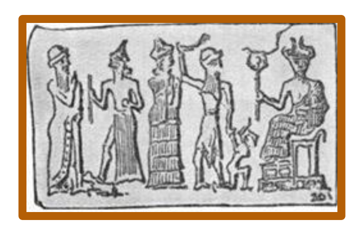
Child sacrifice / Molech