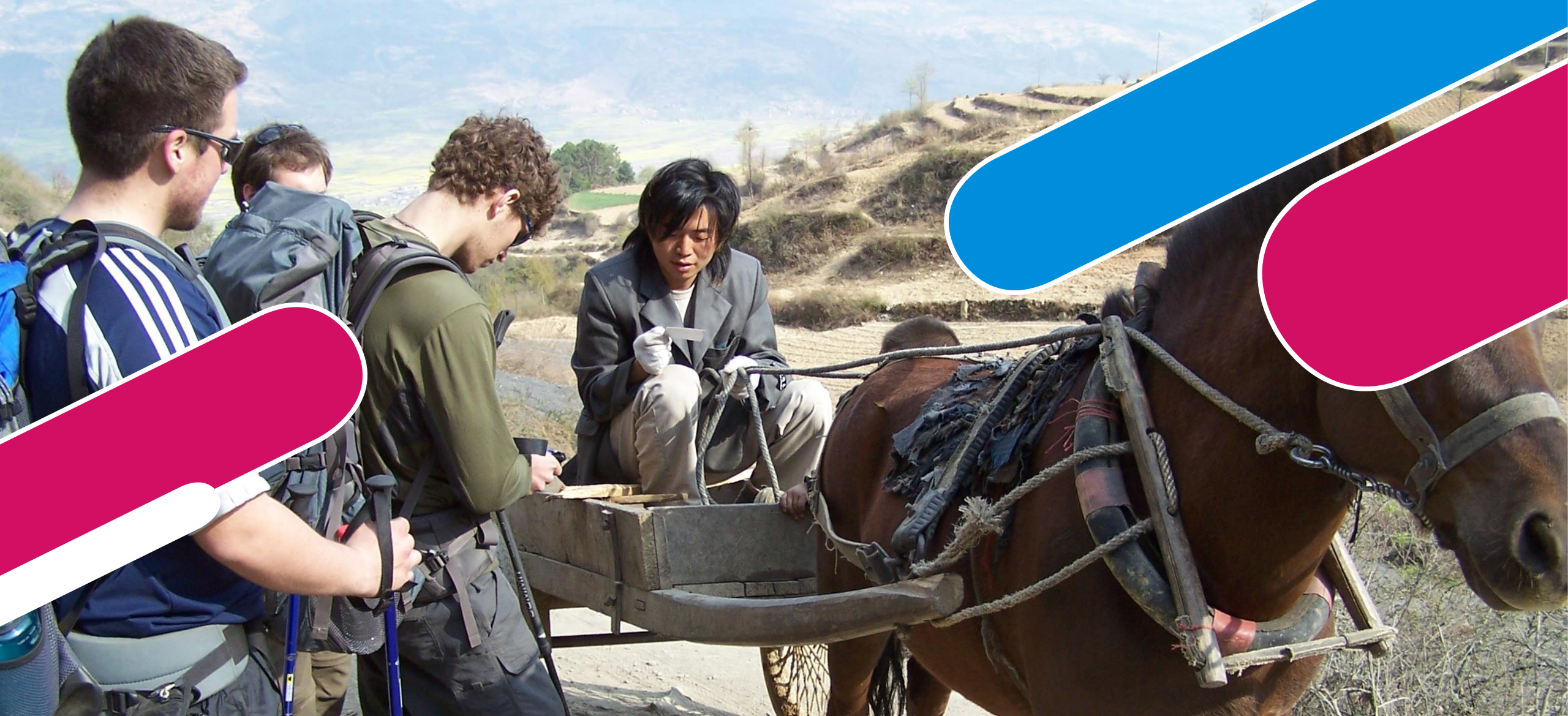
Bear (taking photo) and team passing out Bibles and radios in the Himalayan Mountains of China