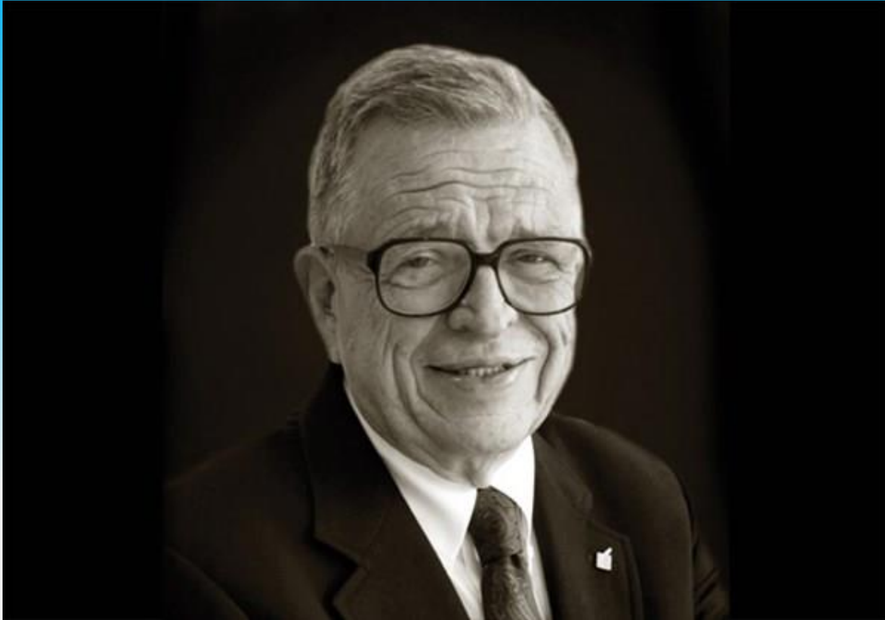
Chuck Colson 1931-2012