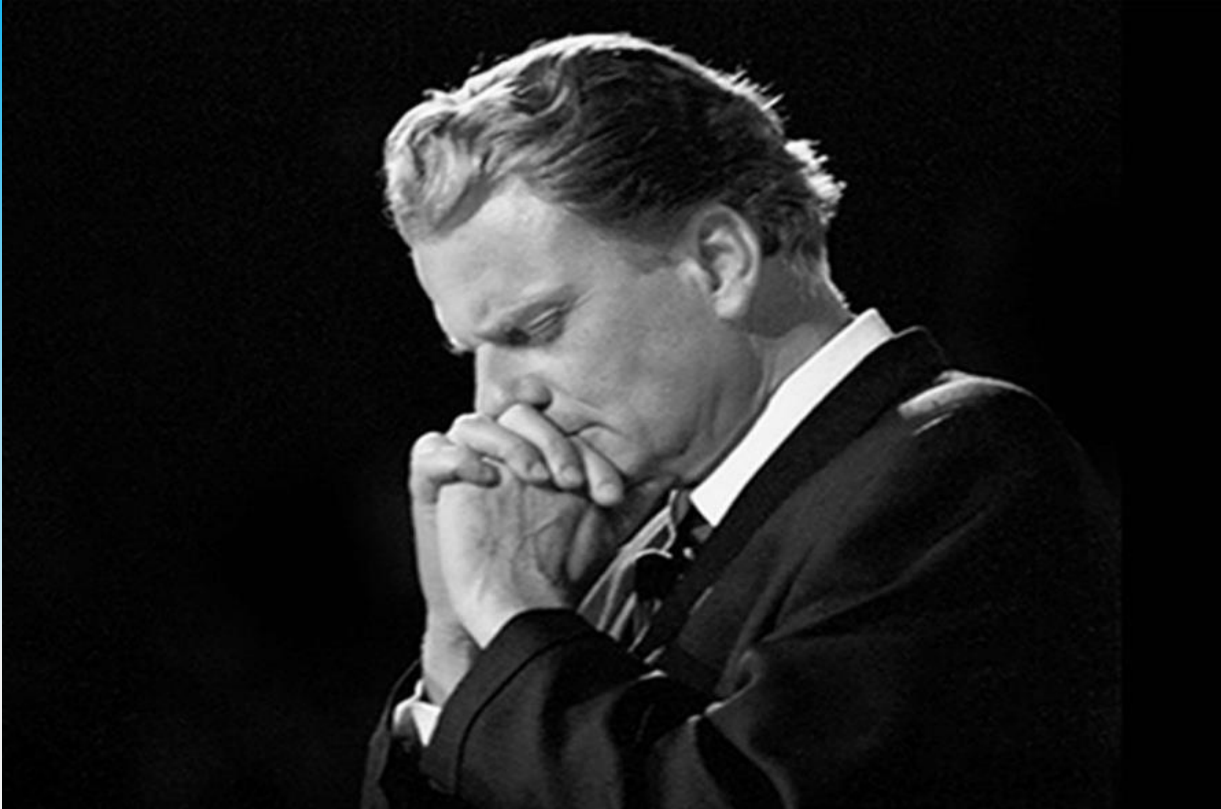
Billy Graham 1918-2018