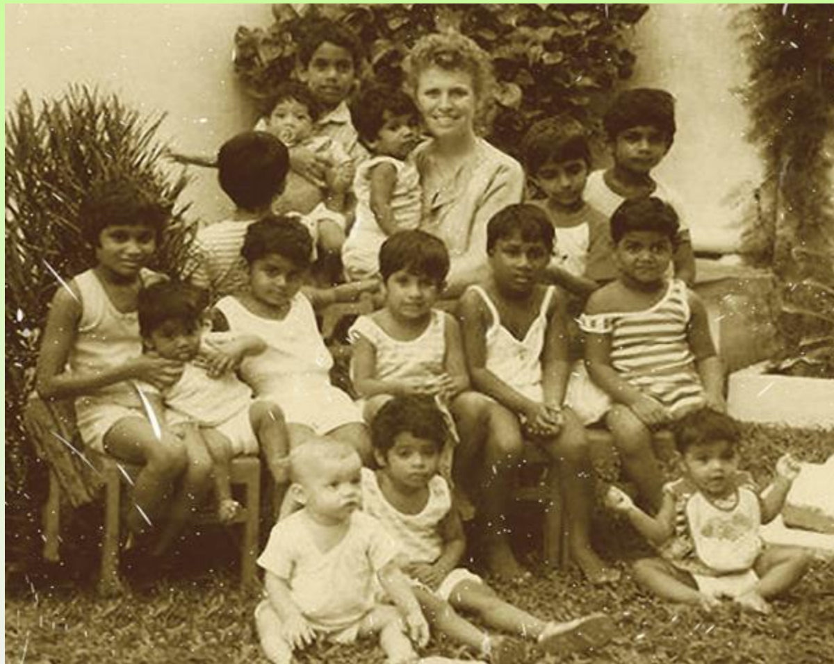
Amy Carmichael 1867-1951