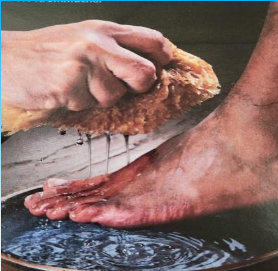
Decision Magazine Nov 1996 pg. 26