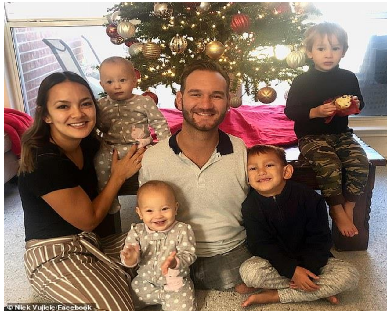
Nick Vujicic World Wide Evangelist Life without Limbs Ministry