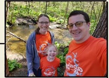
HANSONS Grand Rapids